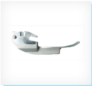
Optional blade sizes available are: Miller 0