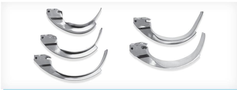
Optional Curved Mac "D" Blades Sizes 1,2,3,4,5