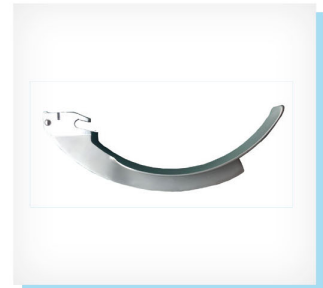
and Mac 5.